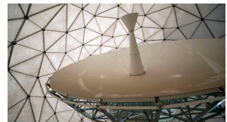
A Colorado Air National Guard F-16 Fighting Falcon takes off over the Denver skyline at Buckley (top). In addition to supporting its aviation mission, Buckley's REPI partnership protects line of sight for satellite dishes used for defense, intelligence, and space missions (bottom).